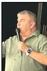
Romney Tannehill Missouri